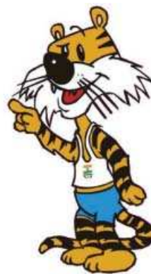
The official Games mascot "Shera"

India, surpassing the IX Asian Games (held in Delhi in November- December 1982) and the I Asian Games (held in Delhi in March 1951).