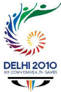
The Games logo