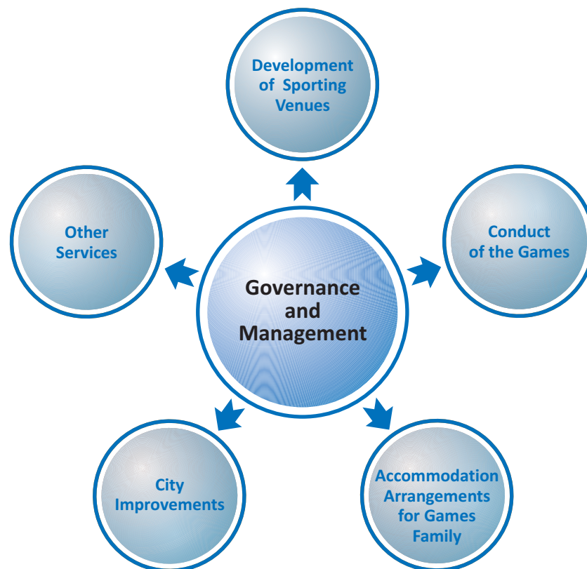
Figure 1.1 - Organisation of CWG 2010

The organisation of the Games (and, indeed, any other multi-sport international events) constitutes a complex, long-gestation, multi-dimensional project with numerous participants/ activities.