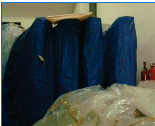
Non-use of trampoline during CWG 2010