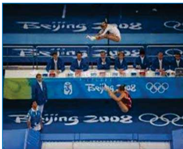
Use of trampoline during Beijing Olympic 2008