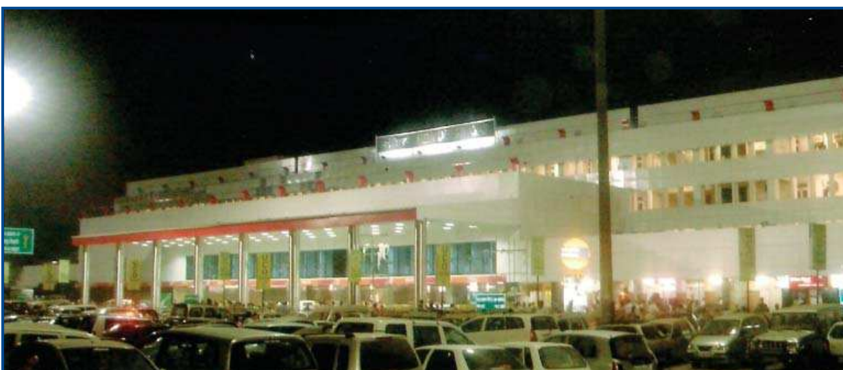
New Delhi Railway Station in time for the Games

All the major activities relating to makeover of New Delhi Railway Station were completed before the Games and within a tight budget of Rs. 44.68 crore.